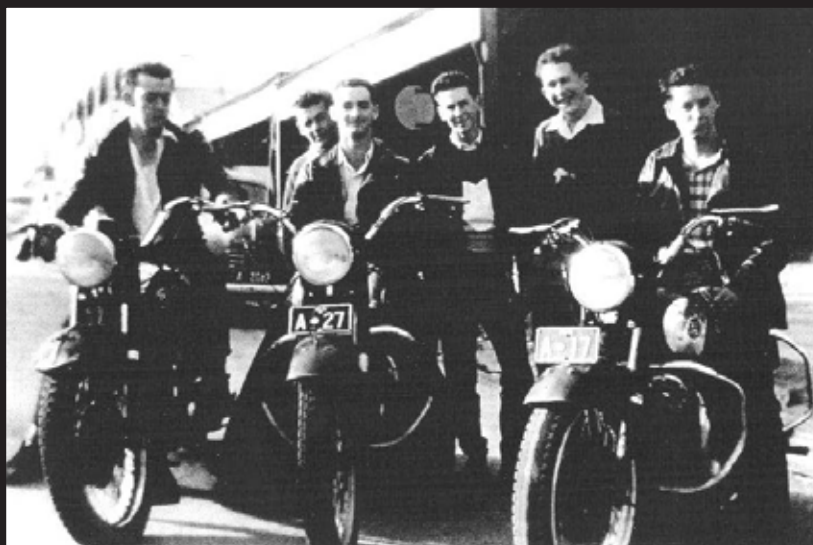
Anybody put a name to this Albany crowd?

$40 - $60 is given to the driver towards petrol expenses etc. A trailer is available for those who need it.