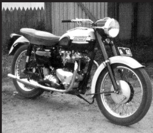
Is this an early Bonnie or a T110?

Many missing from photo. Photo taken in front of Hammers Toy Shop - Rainbow Milk Bar to side in the late 50's or early 60's.